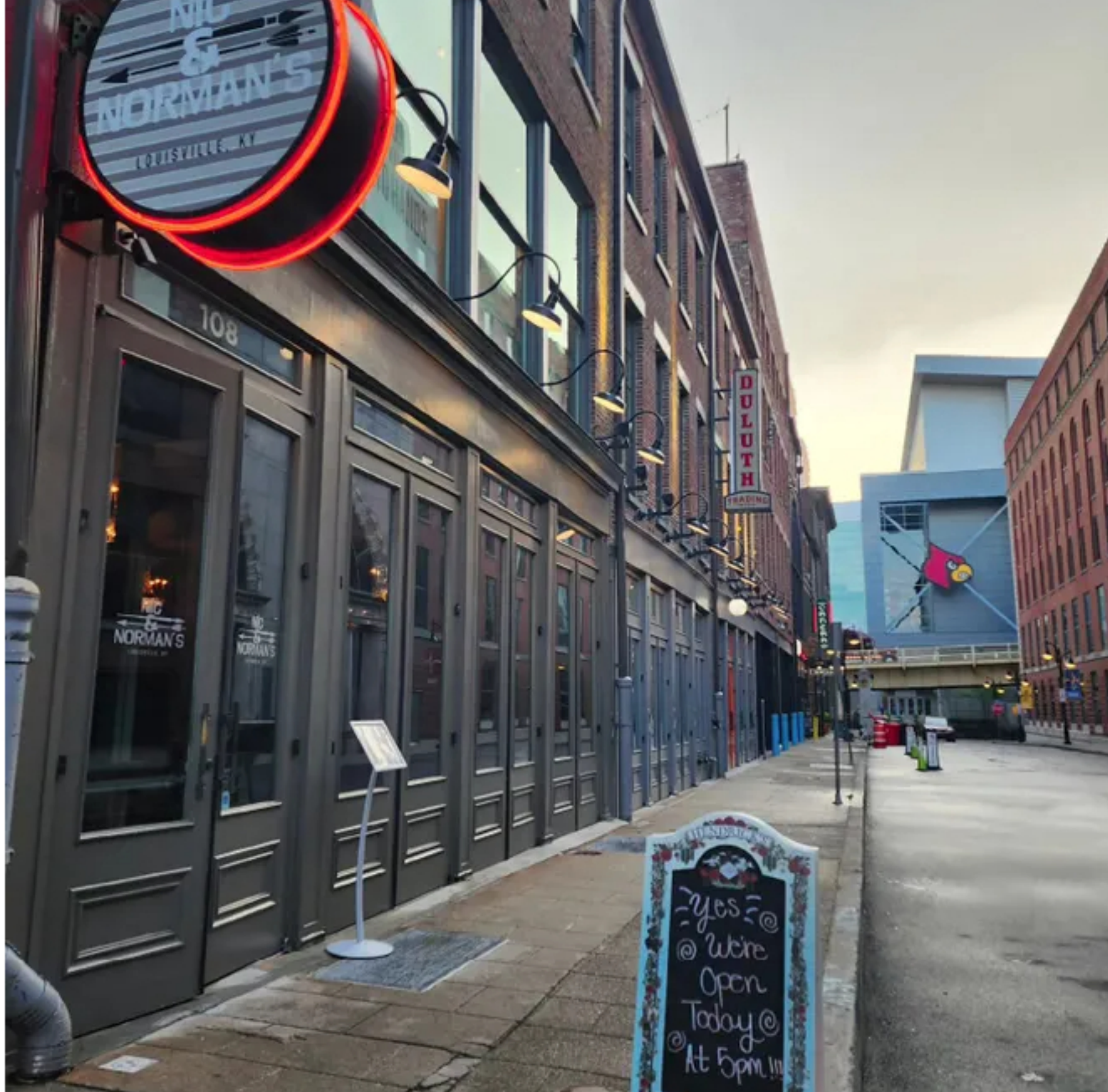
The exterior of Nic and Norman's restaurant in downtown Louisville.