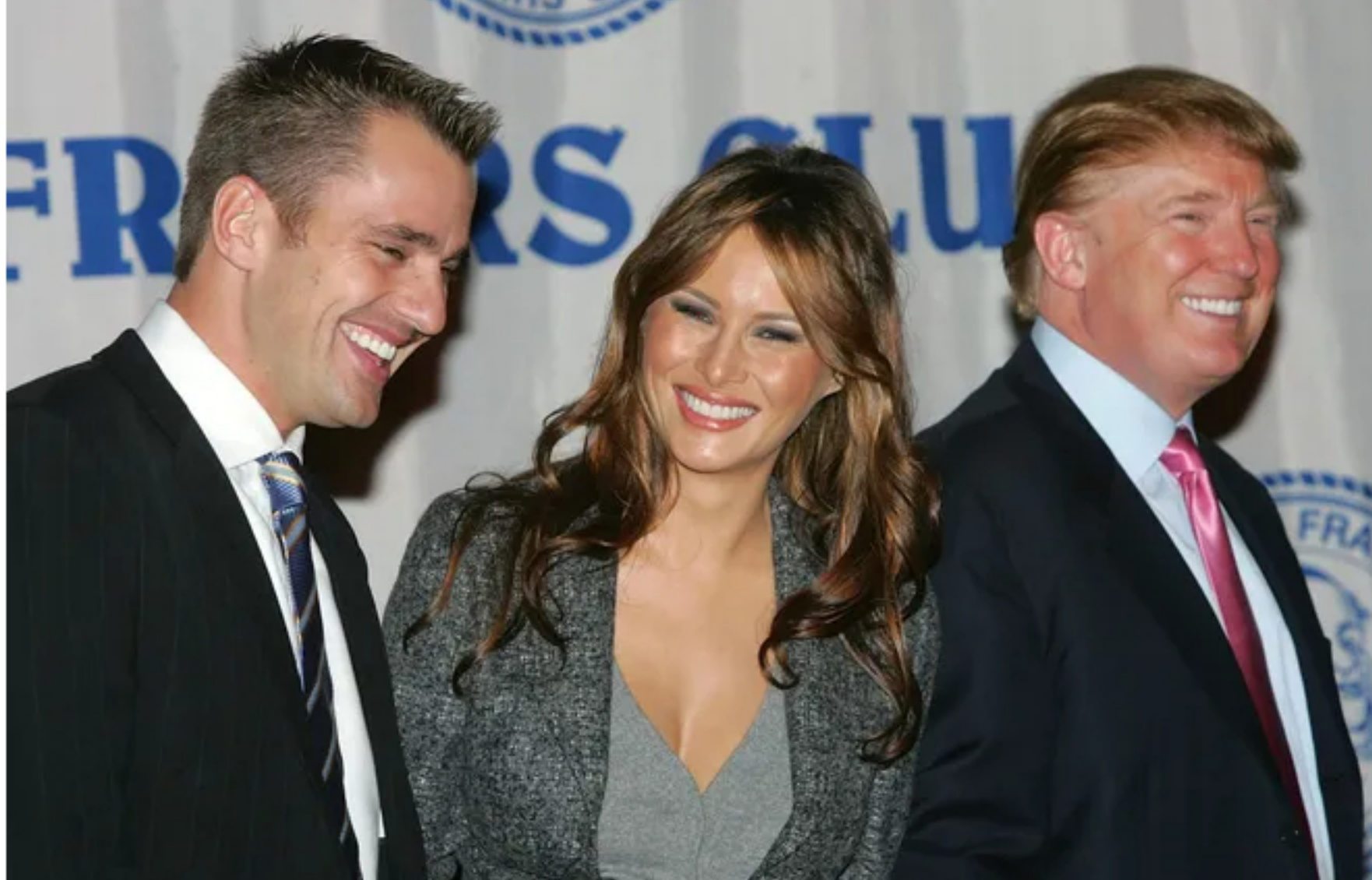
Season 1 winner of "The Apprentice" Bill Rancic, in 2004 with President Donald Trump and POTUS Melania months before they were married.