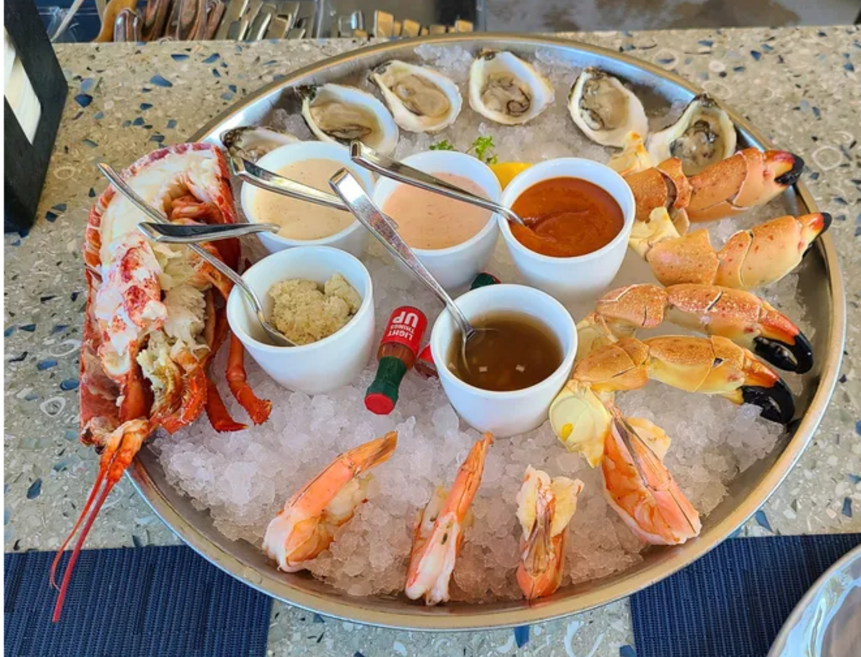
1000 North's shellfish platter.