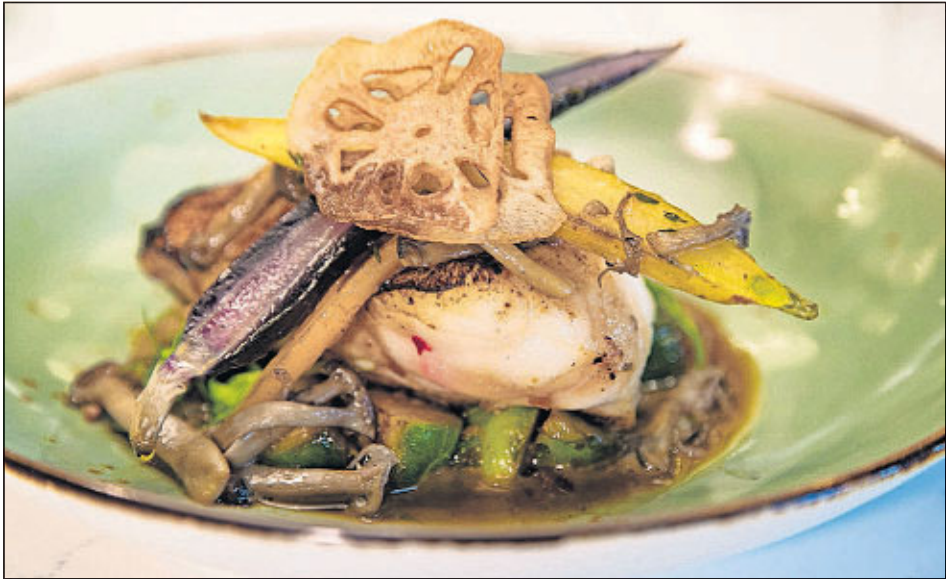
Avocado Grill's Miso-Glazed Chilean Sea Bass with caramelized soy brussels sprouts, baby carrot, beech mushroom and crispy lotus root.

large plates in West Palm and Palm Beach Gardens locations. 125 Datura St, West Palm Beach;