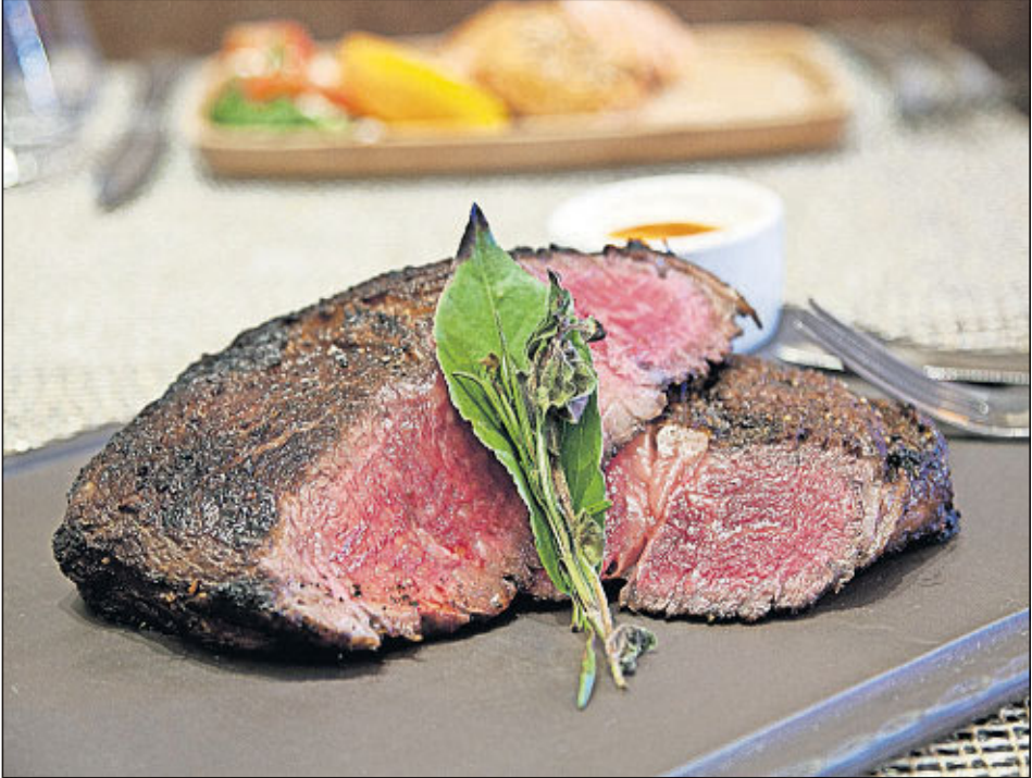
ABOVE: On Sundays at Meat Market, steaks denoted as "signature" on the menu are half price, including the ribeye.

561-623-0822 or 11701 Lake Victoria Gardens Ave #4105, Palm Beach Gardens; 561-766-2430