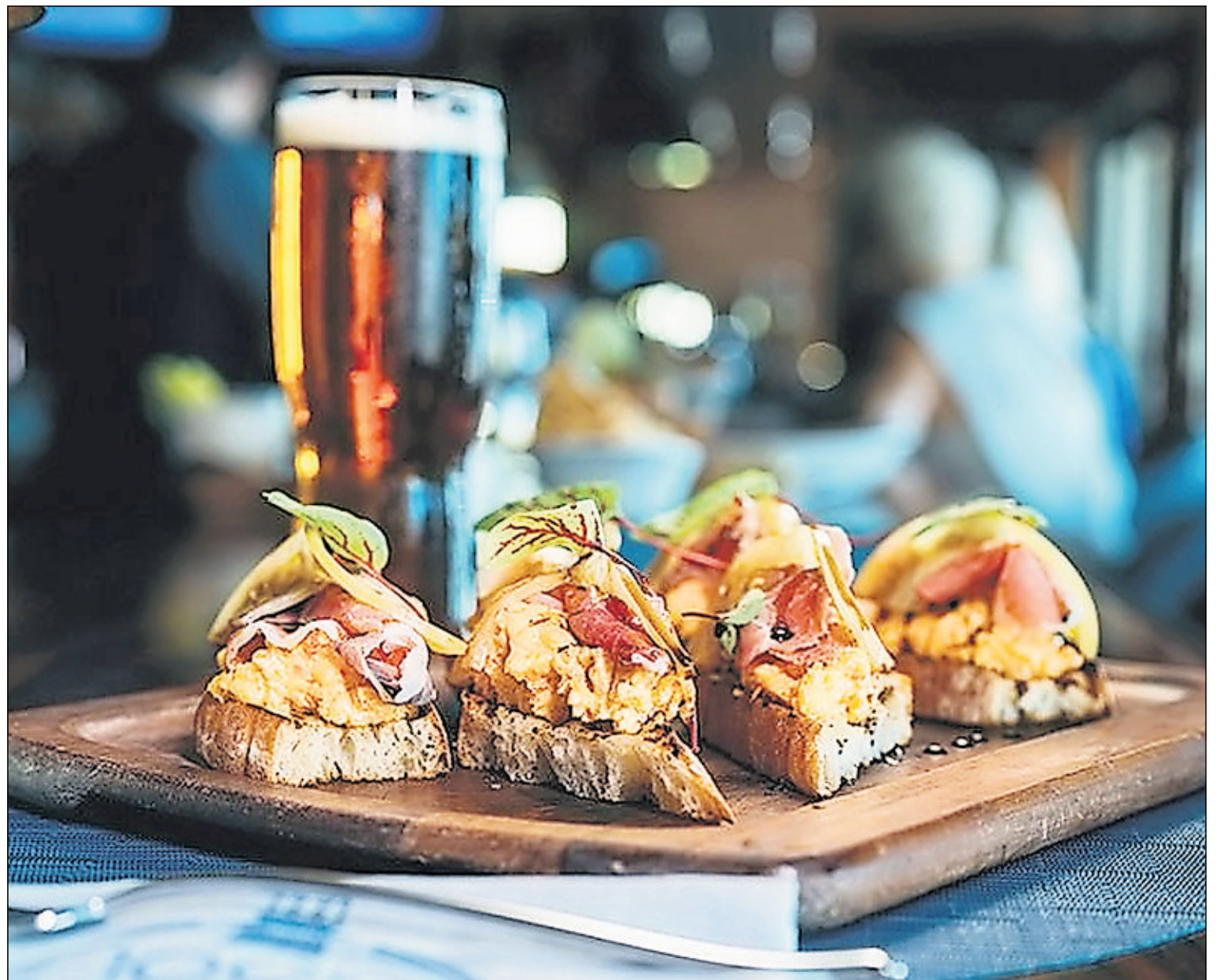
On the "Summer Social Hour" menu at 1000 North in Jupiter: pimento cheese toast.

Three recipes to get you through the long, hot summer.