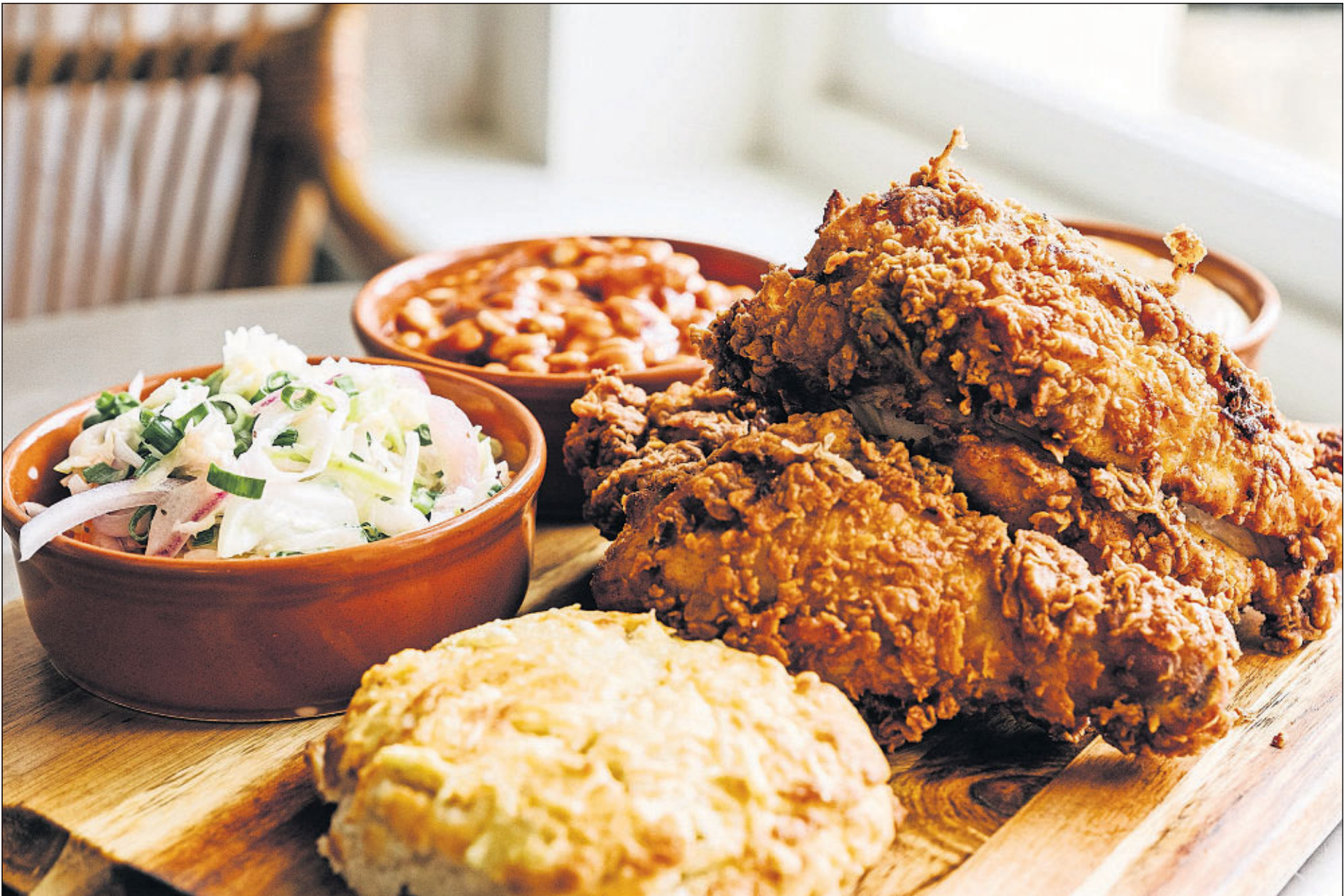
Buccan's Chef Clay Conley brings back his summer fried chicken special. On Sundays through September, three pieces of chicken with specialty sides (collards, baked beans, mashed potatoes, biscuits) are $27.